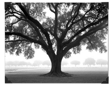
Table of Contents for The Shaken Tree Information and Application Packet